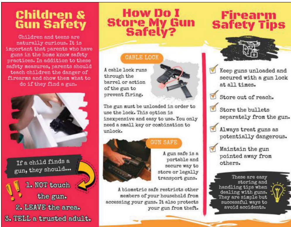
Fig. 4. Page 2 of firearm safety brochure to be distributed with cable locks and biometric gun safes.

grant will fund several initiatives designed to reach specific populations.