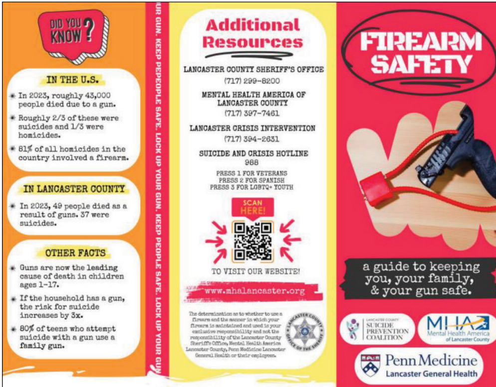
Fig. 3. Page 1 of firearm safety brochure to be distributed with cable locks and biometric gun safes.