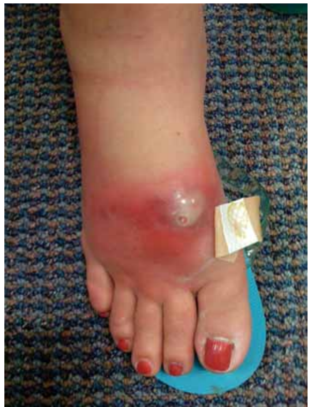
Figure 3: Spontaneous abscess and cellulitis caused by Community-Acquired MRSA.