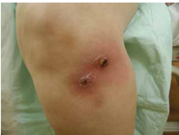
Figure 2: Typical “spider bite” lesion of CA-MRSA.

Standard soaps, even those labeled ‘anti-bacterial,’ have little effect on colonization with MRSA. Topical chlorhexidine soaps at 2-4% concentration, however, are bactericidal for CA-MRSA. Although formal studies are lacking, use of these soaps thrice weekly can provide both treatment of minor skin lesions, as well as decolonization of the skin surface. In a few patients with very superficial lesions, this regimen may suffice for treatment.