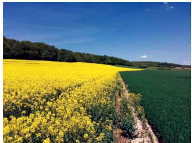
Fig. 4. Current day view of the fields in Souilly where Evacuation Hospitals Nos. 6 and 7 were located in 1918. The concrete structure is presumably the remnant of the receiving and dispatching platform. (Photo taken by author on May 7, 2016.)

The hospital's logbook entry for September 12 reads: