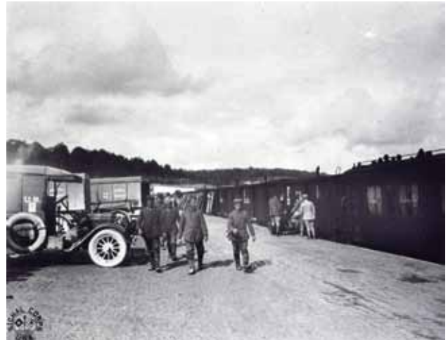
Fig. 3. View of the receiving and dispatching platform in front of Evacuation Hospitals Nos. 6 and 7 at Souilly. The soldiers walking towards the photographer are German prisoners of war.

Evacuation Hospital No. 7 started operating as a hospital again on August 28, but at first the cases were mainly personnel with influenza/Spanish flu (see below). The Battle of St. Mihiel, the only offensive launched solely by the U.S. Army in WWI, 5 commenced on September 12 and ended September 14. 9,10